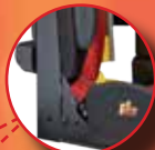
ABTS Dual Seatbelt Retractors