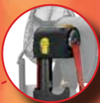
RiteHite™ Customized Seat Belt Fit